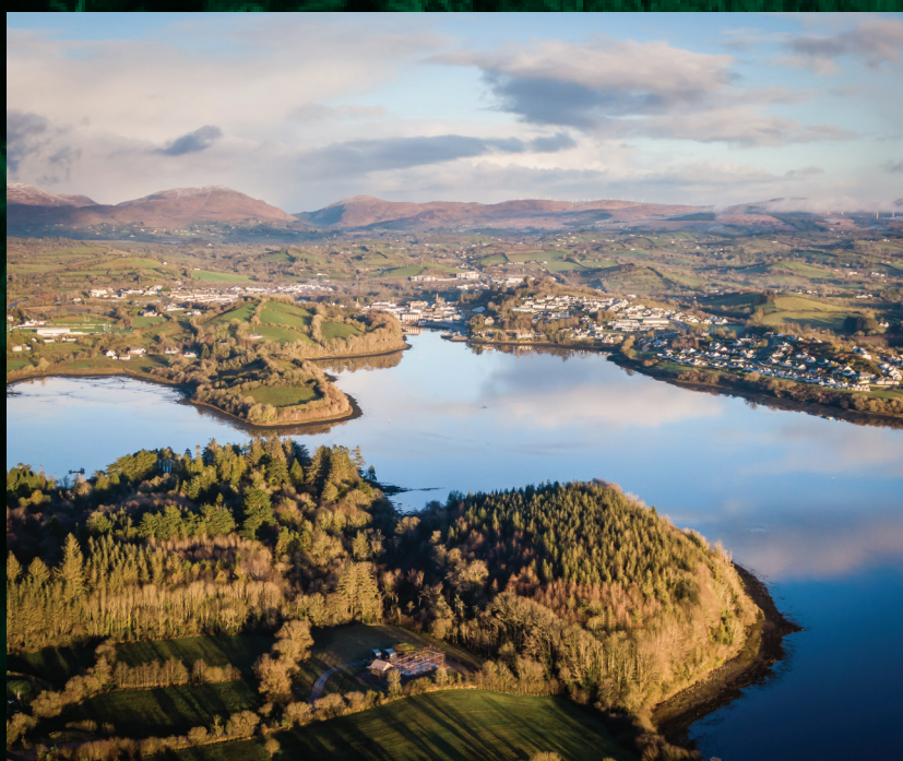
Mac Manus Estate