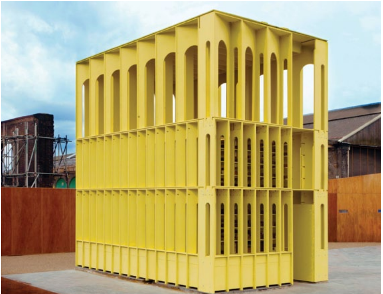
New Horizon – Architecture from Ireland, Irish Design 2015. Red Pavilion by Clancy Moore, Steve Larkin Architects and Taka Architects using SmartPly OSB and Yellow Pavilion designed and built by Hall McKnight, using Medite Tricoya Extreme, exhibited at London Festival of Architecture 2015.