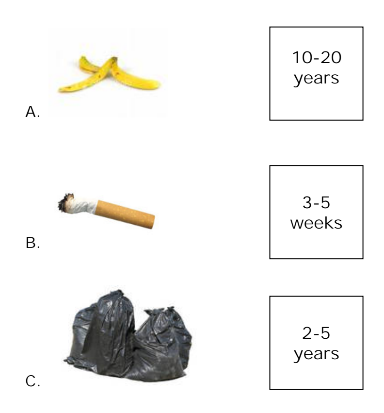
Each correct answer scores 5 points

Do you know how long it takes for the items pictured below to decompose? Match up the times with the items.