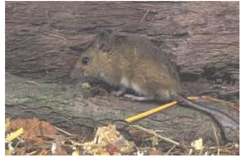
B. Wood Mouse