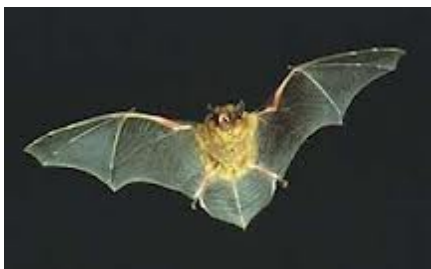
E. Pipistrelle Bat