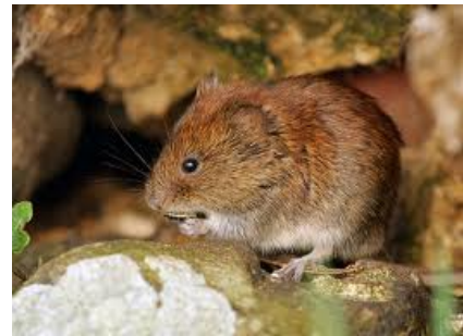
D. Bank Vole