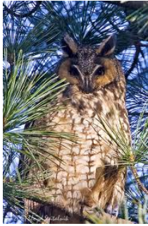
A. Long Eared Owl

Ballyhoura Forest has creatures which are active at different times. Creatures which are active during the daytime are Diurnal and creatures that are active at night are Nocturnal. Can you tell whether the 5 creatures below are Nocturnal or Diurnal?