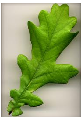
C. Oak Leaf